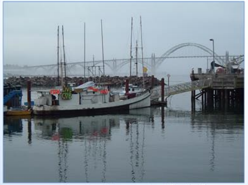
Newport by Bob Sweet