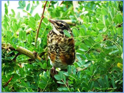
Robin