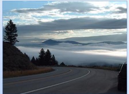
Morning Fog by Bob Sweet