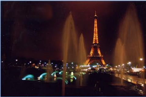
Eiffel Tower