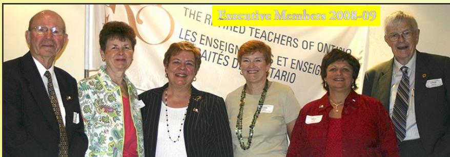
Executive Members 2008-09